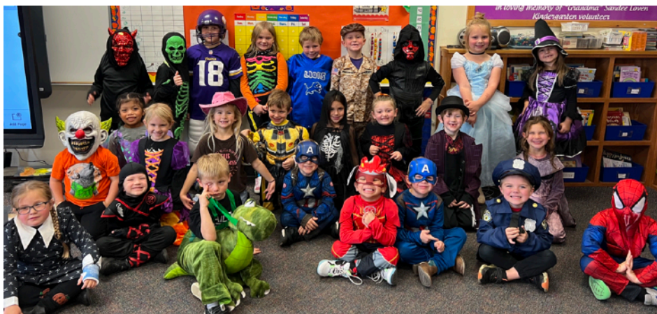
Kingergarten had fun with the football and volleyball teams, law enforcement officers, and Halloween!